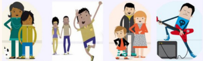
Handling Anger in the Family